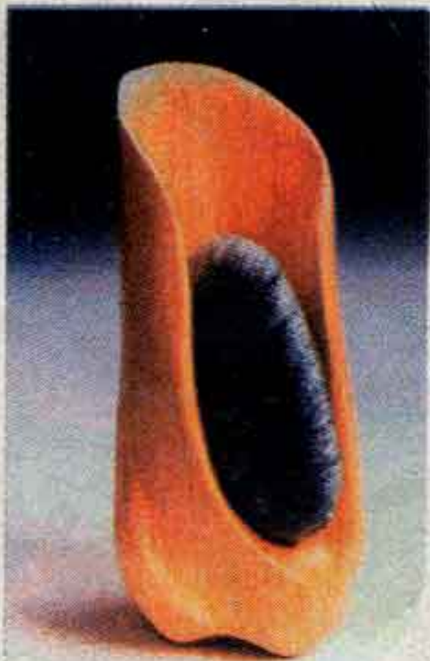
Joel Phelps' North Shore series, #3